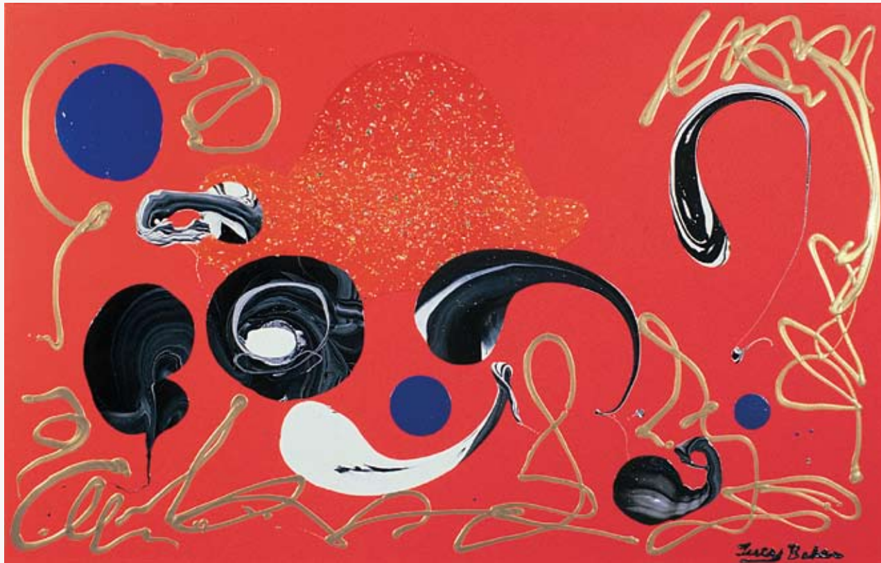
Lucy Baker 60 x 96 inches* Acrylic on canvas