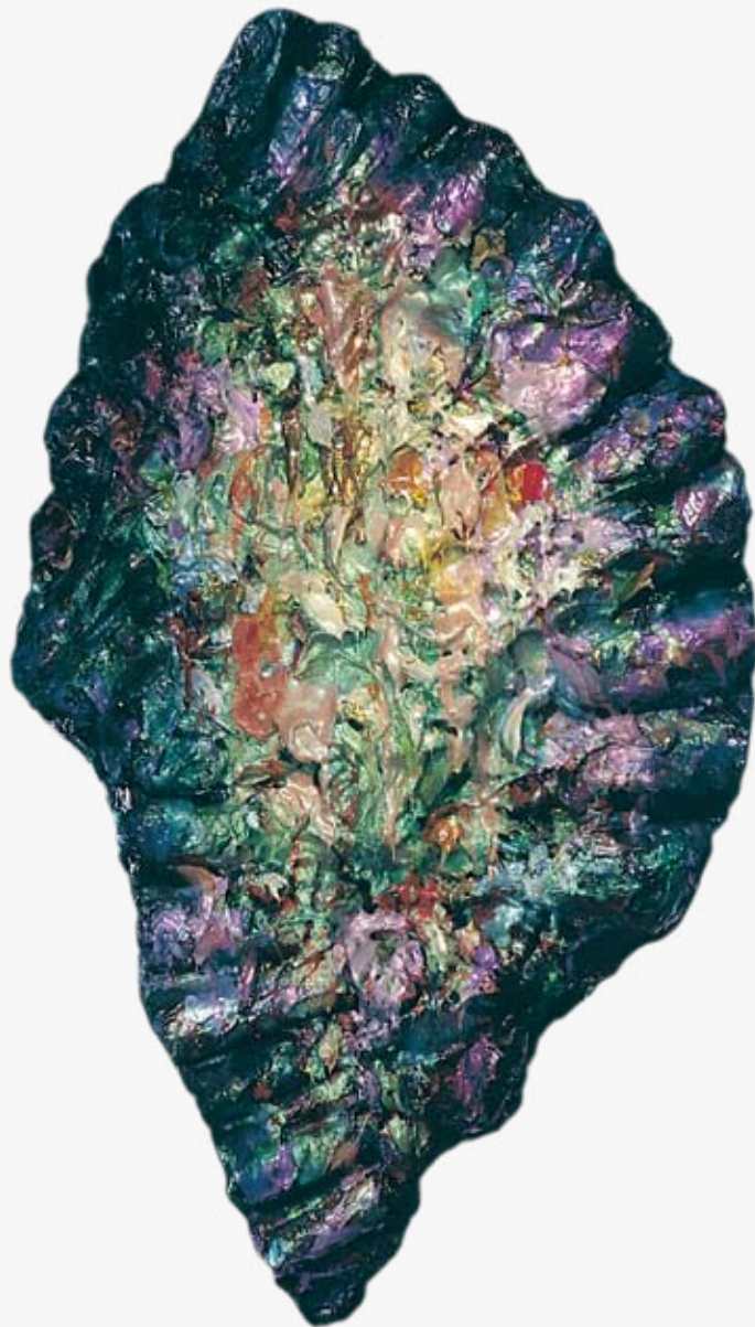
Steven Brent 70 x 52 inches* Acrylic on canvas