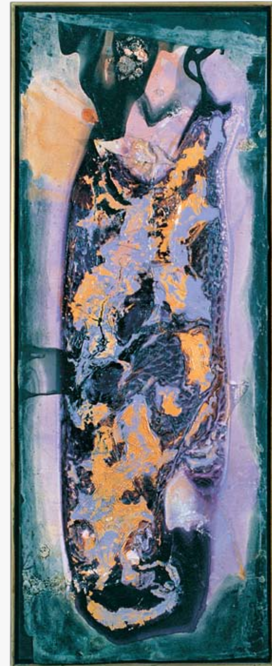
Plunge 1988 84 ¾ x 31 ¾ inches

Great love is needed to achieve this effect, a love capable of inspiring and sustaining that patient striving towards truth, that glowing warmth and that analytic profundity that accompany the birth of any work of art. But is not love the origin of all creation?”