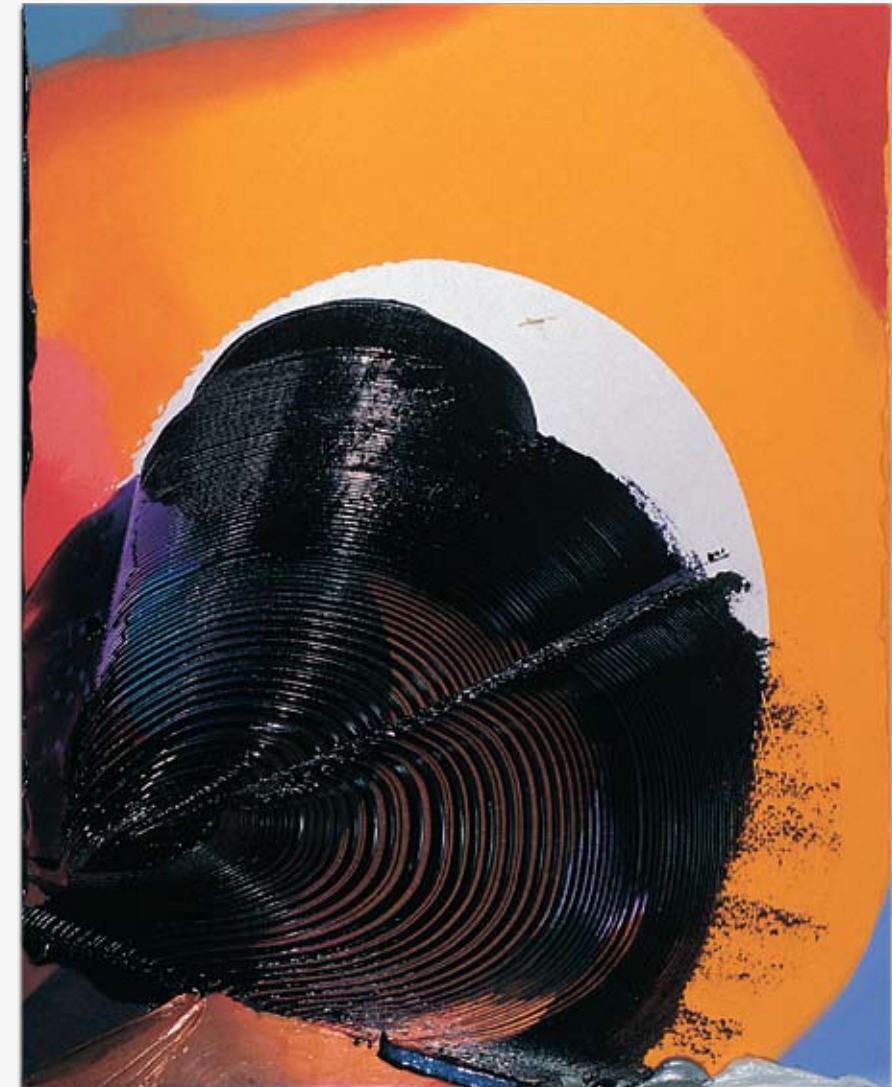
Joseph Drapell Gatekeeper , 2001 72 x 62 inches Acrylic on canvas

This has evolved in contemporary times to where the fluidity of the medium is being explored by some artists as the source for new forms. This is particularly true in my work. The direct influences on the development of my work, and those painters central to what I refer to as The Fluid School in Western art, begins with Juan Miro (1893 - 1983). Miro explored the poured circle and dribble, and made use of these pourings as visual elements in his work. Hans Hofmann (1880 - 1966) and Jackson Pollock (1912 - 1956) also experimented with new forms of drawing and paint application. Pollock was introduced to the use of liquid paint by the Mexican muralist David Alfaro Siqueiros at an experimental workshop in New York City in 1936, thereby discovering his signature drip drawing. Hofmann, who had also tried drawing with fluid dribbles, preferred the spontaneous palette-knifed grounds combined with his signature slabs of colour. In Hofmann's