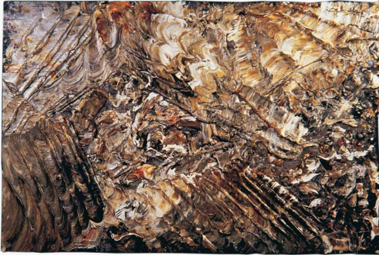
Roy Lerner 60 x 90 inches* Acrylic on canvas

late work, he employed thinner applications in which he accepted and encouraged the drawing from the pooling of the washes, plus he also left the easel and began to work flat on the floor. Helen Frankenthaler (1928 - ) poured her stains with the canvas flat, encouraging the poured shapes with brushes, but often accepting the fluidity of the initial pour and developing her imagery around these formations.