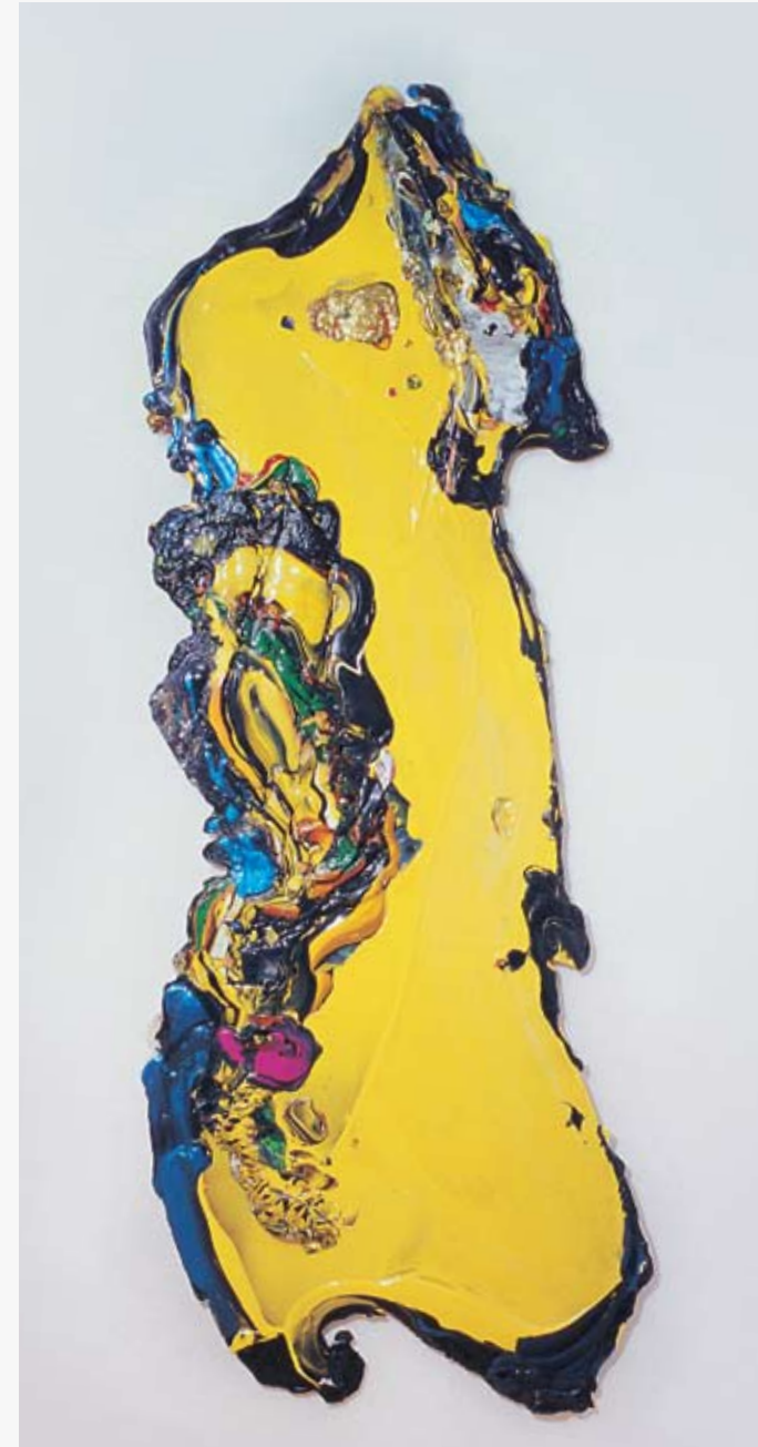
Irene Neal 2000 80 x 30 inches* Acrylic over board

Is innovation limited by the general availability of standard paint products? Only future painting and painters will determine that. My question is, with technological innovation so present in society, what options are available to artists to learn and be qualified to use raw acrylic mediums? Should universities offer courses in paint chemistry to painting students? I certainly believe there is merit in doing so and can see how such a course would aid students in their development.