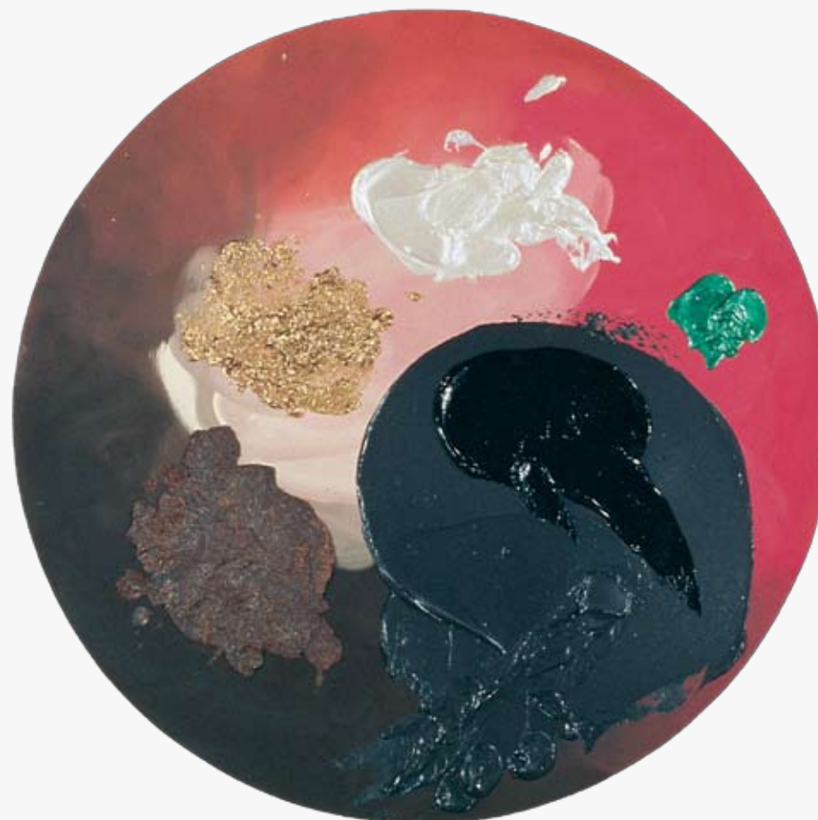
Jerald Webster 48 x 48 inches* Acrylic on canvas

All these artists exploited the fluidity of the medium and its natural properties by the way they set-up, handled and/or provided for its reception. Be it by the use of a spray gun, by guiding pours with a brush, by throwing paint with a bucket or by the orientation of the canvas, all these acts endeavoured to capture the behavior of the paint as fluid substance and the forms it could be made to become, all guided by the imagination of the artists. I refer to this pictorial evolution as the 'Fluid School' of painting