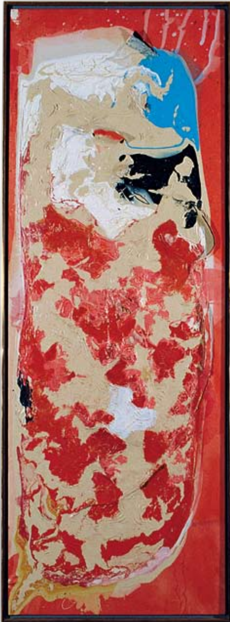
Rossa Bluff 1988 72 x 25 ½ inches