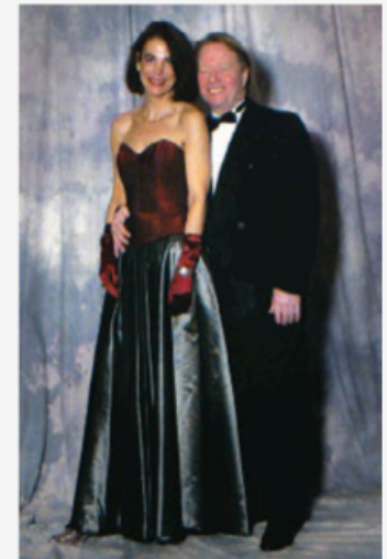
At a formal event in 2000.